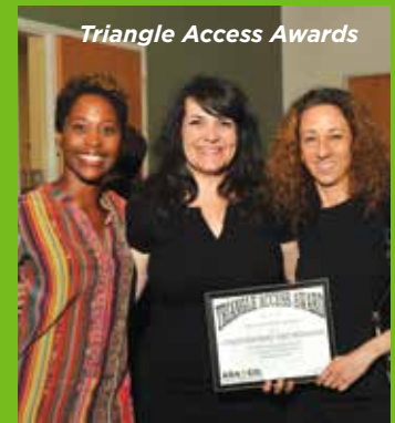
Triangle Access Awards