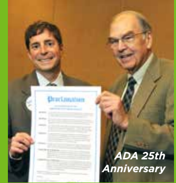
ADA 25th Anniversary

As we expand opportunities for people with disabilities in our State, we must continue to strengthen our current partnerships while establishing new relationships to promote and advocate for a more informed, inclusive and integrated North Carolina.