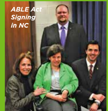
ABLE Act Signing in NC