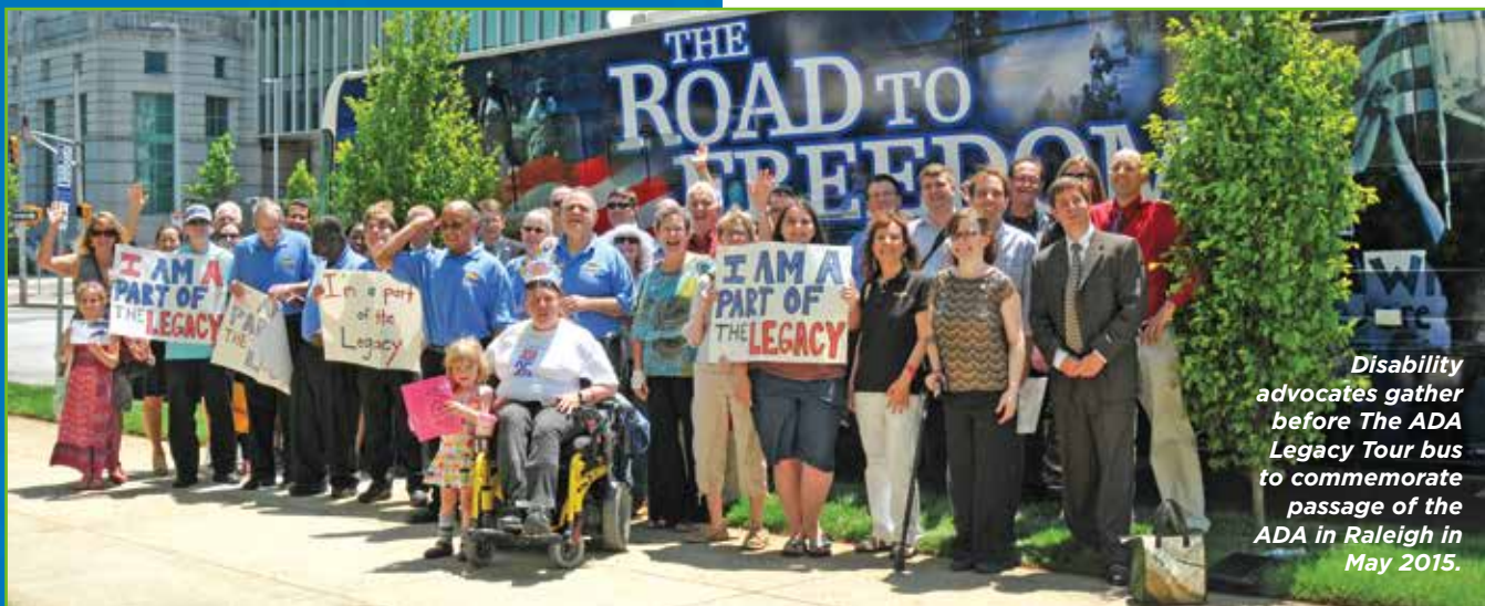
Disability advocates gather before The ADA Legacy Tour bus to commemorate passage of the ADA in Raleigh in May 2015.