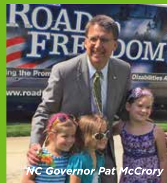
NC Governor Pat McCrory