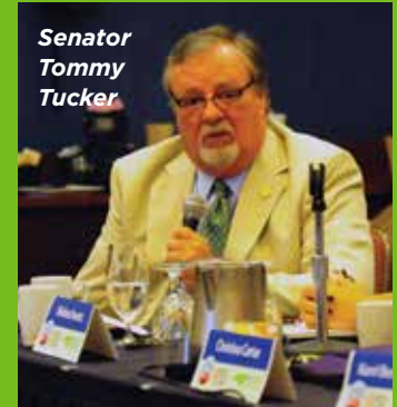
Senator Tommy Tucker