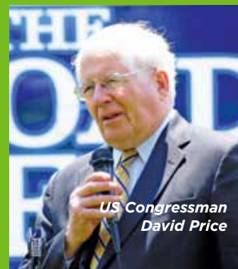
US Congressman David Price