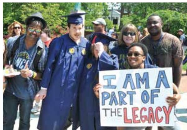
Students from UNCG's Beyond Academics celebrate during The ADA Legacy Tour stop in Greensboro.