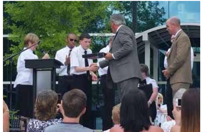
Project SEARCH Graduation

Western Carolina University's Learning and Earning After High School initiative provided transition services and resources for students with intellectual disabilities, even for those with the most complex needs. In partnership with the NC Department