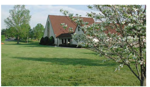
J. Iverson Riddle Developmental Center