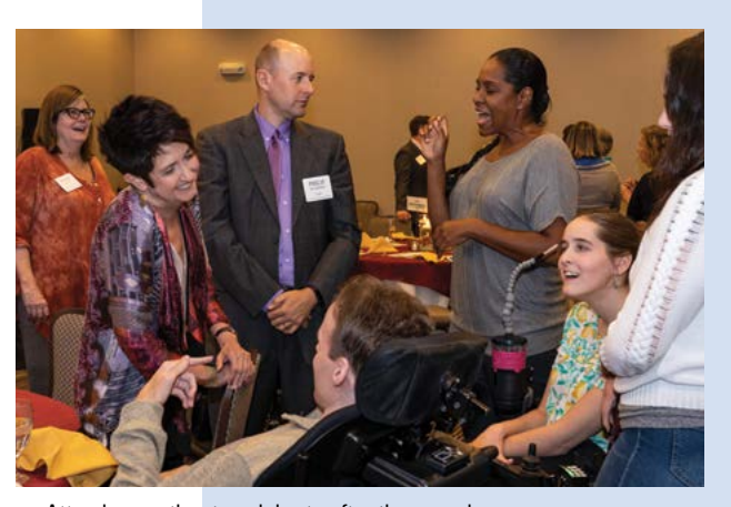
Attendees gather to celebrate after the awards ceremony.